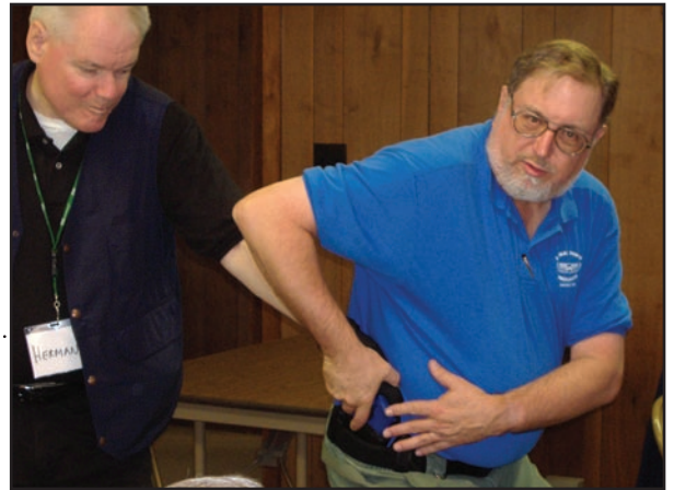
right: Training to prevent a gun grab at a Lethal Force Institute Class in Live Oak, Florida.