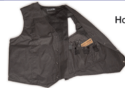
Holster Vest $179

www.concealedcarryoutfitters.com ☆ 866-802-4356