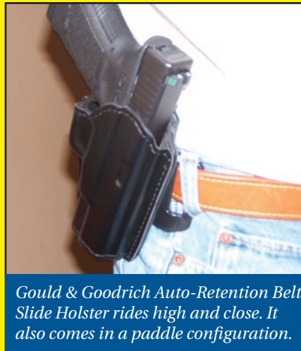
Gould & Goodrich Auto-Retention Belt Slide Holster rides high and close. It also comes in a paddle configuration.