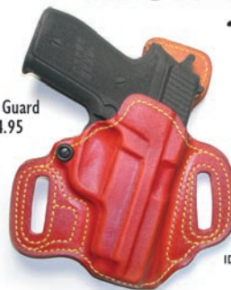
Slide Guard $74.95

"Innovative Holsters for Armed Professionals"