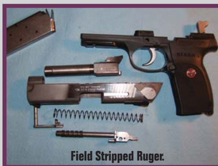
Field Stripped Ruger.

Field stripping for cleaning and routine maintenance is simple and easy. The procedure is identical to that employed with the earlier P-Series pistols. The steps are delineated in the user's manual. However,