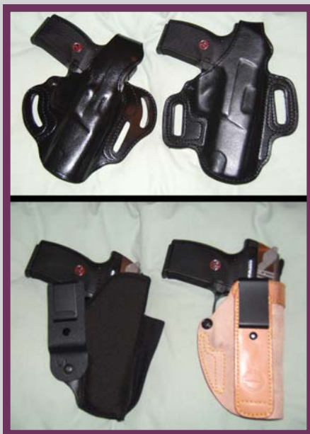
Top: Two Rugers in Galco & High Noon Holsters. Bottom: Ruger's in DeSantis, 'Tuck This' and High Noon, 'Hidden Impact IWB'.

that fits well, and so does High Noon Holsters, www.highnoonholsters.com . It is called the "Sky High". High Noon also makes their "Hidden Impact", and "HiddenAlly" tuckable IWBs for the Glock 21, that just happen to fit the Ruger P345R pretty darn well, and Desantis, www.desantisholster.com , makes their "Tuck-This" IWB for large semi-automatics that fits perfectly. High Noon has stated that they will soon be molding their full line of IWBs and belt slides for this gun. I can't wait.