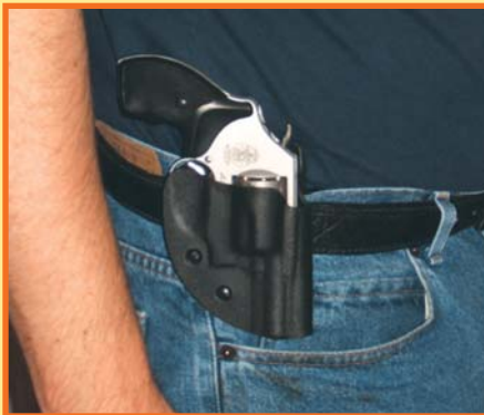
DeSantis “Jackel” Paddle” Holster.

side is that most kydex rigs do not conceal as well as leather rigs. The key word here however, is “most”. There are a few notable exceptions, such as the DeSantis kydex, vertical drop, Style 94 “Jackel” paddle holster, as shown in the photo, carrying a Smith & Wesson J-frame revolver. You can't get a closer, more concealed carry, and with the paddle feature, it's easy on and easy off.