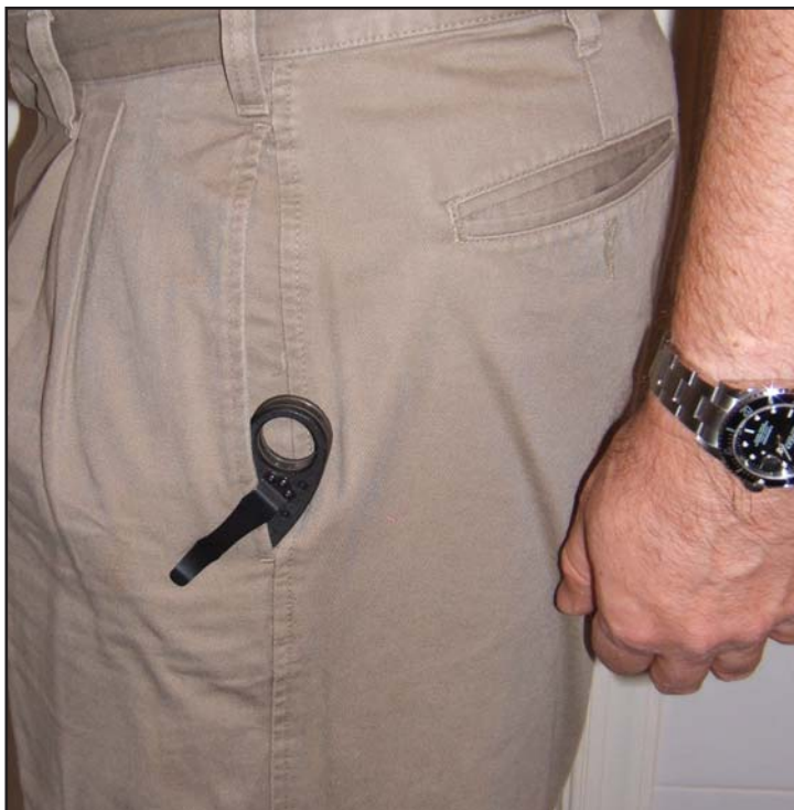
Karambit in pocket.

For example, an acquaintance who is in her sixties and challenged by lifelong orthopedic problems associated with childhood polio, surprised me the other day when she shared that she was a shooter and a concealed carry weapons permit holder. Her outward appearance is of an alert, situationally aware, confident, mature woman, with a notable postural list and limp, who walks with a cane. I would have never guessed