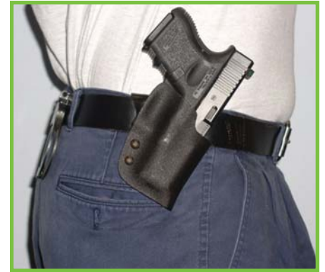
RM Holsters ECP Paddle Holster.

Inside the Waist Band (IWB) holsters are the easiest and most effective way to conceal a compact to full size handgun. The body of the holster rides between your body and your waist band on your strong side. Thus, you have to have enough room inside your waist band! When wearing an IWB, often it is necessary to wear a pair of slacks and a belt that is one size larger than what you normally wear.