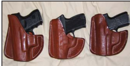
Andrews Custom Leather Right Handed Pocket Holsters (Outside sleeve (Top) and Inside Pocket (Bottom)) for Glock 26/27, Kel-Tec P-11 and Kahr PM9.