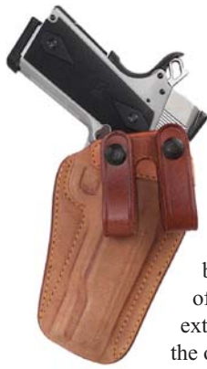
Galco's "Royal Guard".

Galco Gunleather is the manufacturer of a large line of high quality leather concealment holsters. One of the best IWBs made,