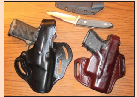
Photo Above: Two Quality Concealment Belt Holsters: Galco "Cop 3" with Thumb Break and Mitch Rosen "5JR Express" with Thumb Break. Tom Krein "TK-8" Defensive and Utility Fixed Blade.

So called, "belt slide" holsters are made with open muzzle ends so they can holster the same pistol in different barrel lengths (e.g., all of the small or large frame Glock).