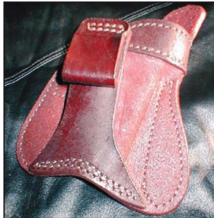
H.B.E. Specialty Leatherworks "GS Tuckable".

Also, with many pancake holsters a thumb break tends to cause the rig to hug closer to your body, improving concealment—definitely a good thing!