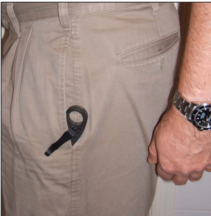
Karambit in pocket.

For example, an acquaintance who is in her sixties and challenged by lifelong orthopedic problems associated with childhood polio, surprised me the other day when she shared that she was a shooter and a concealed carry weapons permit holder. Her outward appearance is of an alert, situationally aware, confident, mature woman, with a notable postural list and limp, who walks with a cane. I would have never guessed