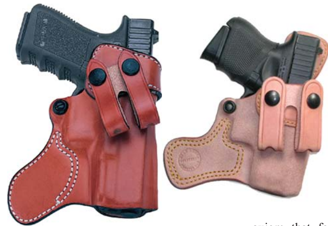
(Above) DeSantis "Inner Piece" IWB. (Right) High Noon Holsters "Tail Gunner" IWB.

and one of my all time favorites, is their famous "Royal Guard". The Guard offers exceptional comfort and durability. Constructed of premium horsehide with the rough side out, and a smooth leather interior, the Royal Guard facilitates a smooth draw and easy one handed re-holstering. Its one way snap-on belt loops will fit belts up to 1-3/4 inches, and with its forward rake and quality design, this rig provides excellent concealment.