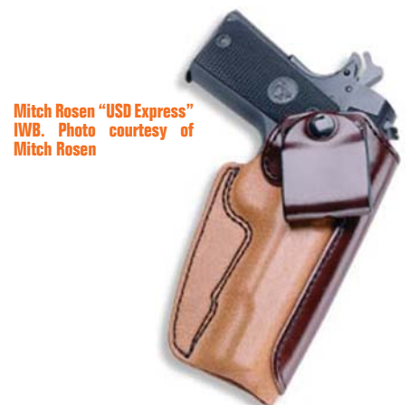
Mitch Rosen “USD Express” IWB.

High Noon Holsters “Tail Gunner” IWB with its unique rear stabilizer wing, helps to keep the holster from rotating or shifting positions.