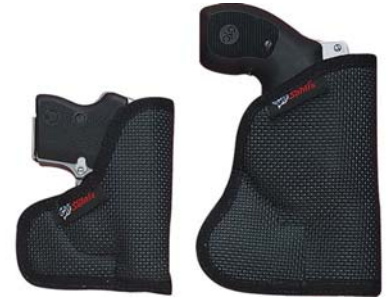
DeSantis "Nemesis".

gun from your pockets at the range. Become used to carrying a pocket sized handgun in your pocket. It's the best way to assure you'll be armed most of the time, and when you need to be.