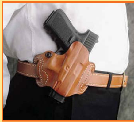
Created especially for the popular Glock 26/27 sub-compact pistols the DeSantis “Style 086” two slot, leather belt holster features an adjustable tension screw, and snug, defined molding.

Kydex rigs are typically more popular for competition and range training because they offer a faster draw. However, the down