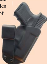
Blade-Tech's, "UCH" Tuckable IWB.

A thumb break retention strap provides secure RETENTION of your weapon. This is a good thing to have if you are going into