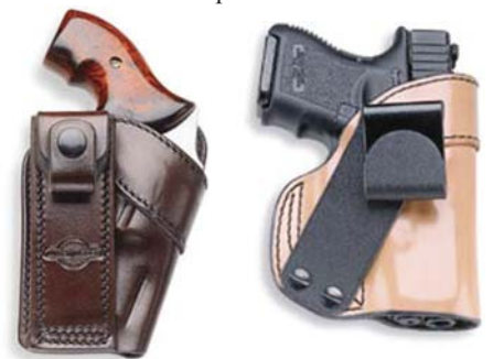
(Above Left to Right) Mitch Rosen "Workman" IWB. (b) Mitch Rosen "Workman Express" IWB.

Blade-Tech's "Ultimate Concealment Holster" (UCH) is a real winner. It is made of hard, thermoplastic synthetic material. This tuckable IWB holster is adjustable for cant, or can be worn as a straight drop. It easily allows the shirt to be tucked into the pants, completely concealing the firearm and holster. The well constructed belt loop and tuckable extension