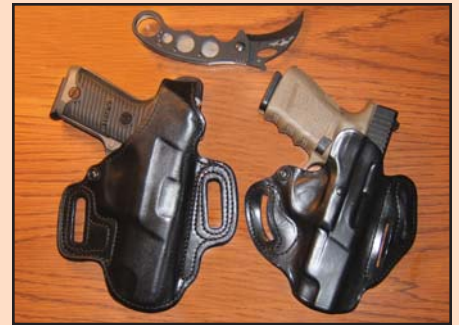
Photo Below: Two More Quality Concealment Belt Holsters: High Noon Holsters "Sky High" with Thumb Break, DeSantis Open Top "Speed Scabbard". Emerson Defensive Folding and Utility Kerambit.

The advantage of course is you save money as the same holster works with all of your Glock. The down side however, is that your muzzle and front sight are not protected. For this reason, I prefer a closed, molded muzzle, and each of my handguns has a holster that is specifically made for it.