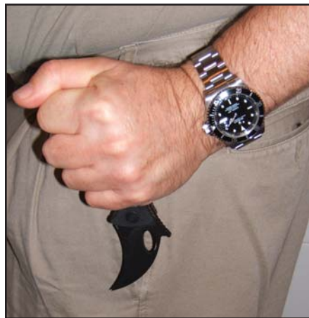
Karambit in second stage of draw.

Don't be afraid of insulting people or being rude. Your life is worth more than that. It's better to be thought of as rude than to be found dead. I want you to enjoy your early retirement. Don't let some dirt bag retire you!