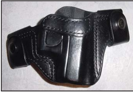
Glock 23 in Alessi CQC-S – Front View. Note the well reinforced open top and the design of the fore and aft snap belt loops. They keep the holster and butt of the Glock tight in to the body.

your belt! Many have copied Alessi's design, but no one has matched it in quality or functionality. It's a comfortable rig to wear all day, under a shirt, sweater, sweatshirt, or jacket.