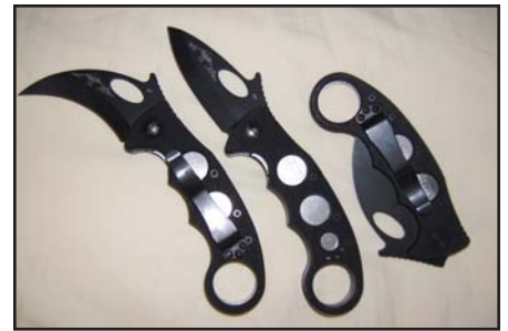
Emerson Pocket Karambit on table.

If attacked fight back viciously and but expect to get hurt, maybe badly—but