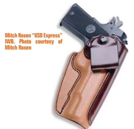
Mitch Rosen “USD Express” IWB.

High Noon Holsters “Tail Gunner” IWB with its unique rear stabilizer wing, helps to keep the holster from rotating or shifting positions.