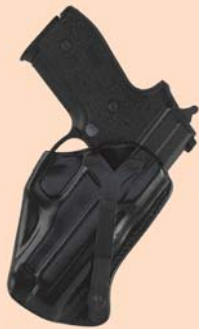
Left: Galco "Skyops" Tuckable IWB.

This rig works equally well as a tuckable or as a regular IWB. The construction of the belt loop and tuckable belt loop extension strut also spell S-T-A-B-I-L-I-T-Y. The reinforced open top and slide guard (which is just the right height) facilitate easy one-handed re-holstering and a comfortable wear. Eric Larsen is a master craftsman and a true artist.